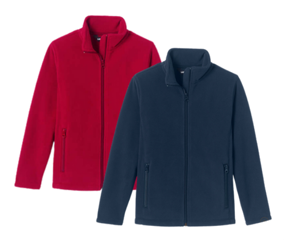
Fleece zip-up, wih logo

Zip front or buttoned cardigan, with logo