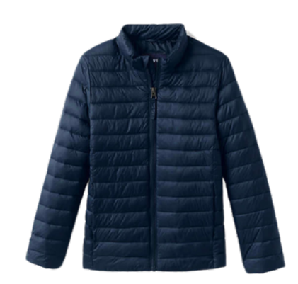
School uniform insulated jacket

Heavy winter coats: Any solid color with no design, not to be worn in the classroom