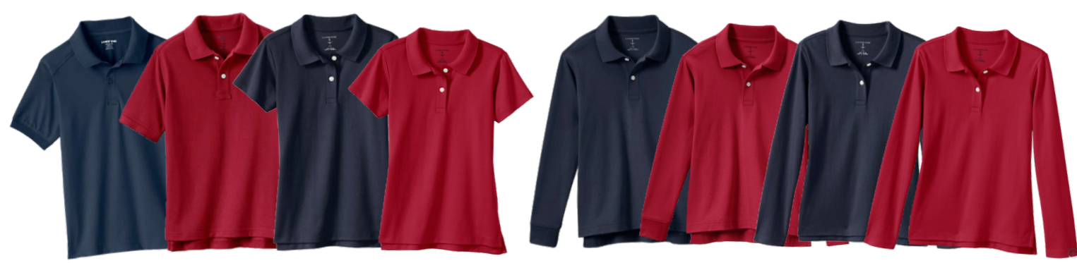
Interlock, mesh, rapid dry, or feminine fit, with logo